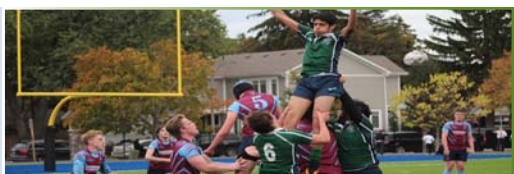
SPORTS & SOCIAL ACTIVITIES