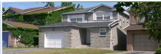
HOMESTAY WITH A LOCAL FAMILY