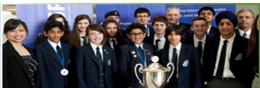
HIGH LEVEL ACADEMICS