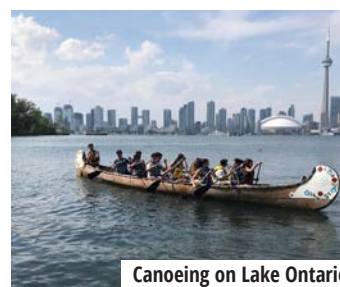
Canoeing on Lake Ontario