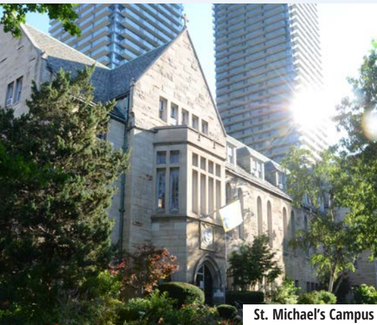
St. Michael's Campus