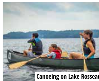
Canoeing on Lake Rosseau