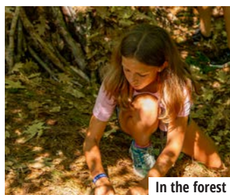
In the forest