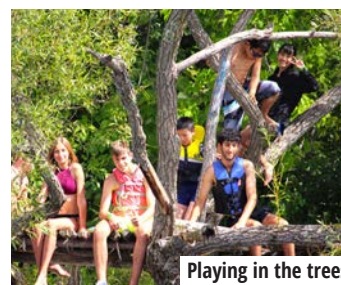
Playing in the trees