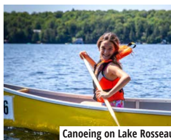
Canoeing on Lake Rosseau