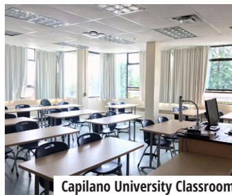
Capilano University Classroom