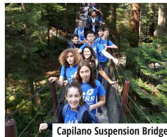
Capilano Suspension Bridge