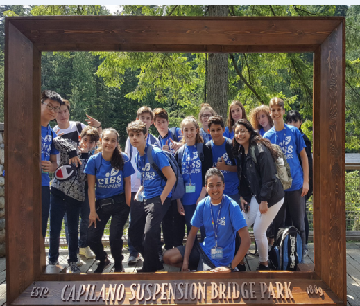
Capilano Suspension Bridge Park