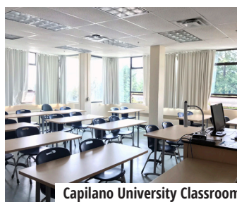
Capilano University Classroom