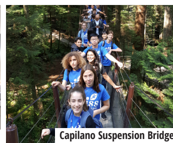
Capilano Suspension Bridge